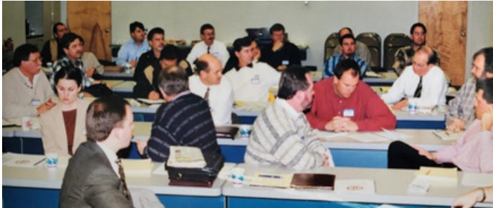
FCIA's 1st FIC Conference, January 1999, developing the 'DIIM'™ Story at UL's Chicago area HQ.

To get the 'DIIM'™ built, FCIA's founding Board developed the strategy. This strategy was implemented by FCIA Committees whose members (supported by staff) worked and "got stuff done". Then, FCIA leadership attended and spoke at CSI/CSC Specification Association Conferences, the International Code Council and NFPA Expo's & Building and Fire Code Development Hearings, participated at the ASTM and UL Standards Development Processes, spreading the word and advocating for the FCIA's 'DIIM'™ Firestopping story.