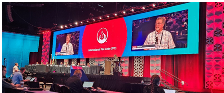
ICC's Code Development Hearings.

With proposal FS53-24, the Southern Nevada Chapter of ICC submitted a proposal to remove the requirement to firestop the bottom of fire-resistance-rated wall assemblies unless the wall abuts two or more interconnected levels. This would remove most bottom-of-wall applications. FCIA, the International Firestop Council (IFC), and Hilti all argued in opposition at this Committee Action Hearing. It is important to note that the change would not take effect until it passes another round of debate for the 2027 IBC.